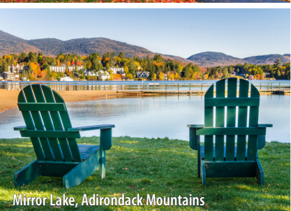
Mirror Lake, Adirondack Mountains