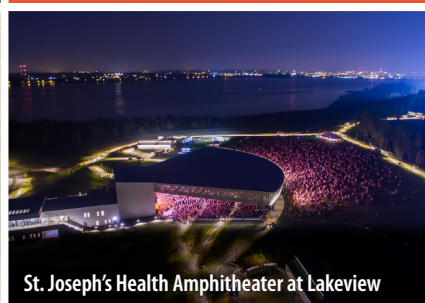
St. Joseph's Health Amphitheater at Lakeview