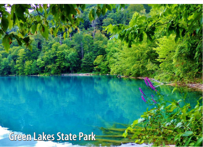
Green Lakes State Park