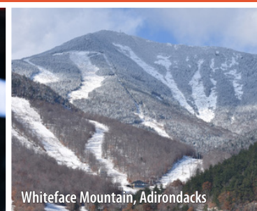
Whiteface Mountain, Adirondacks