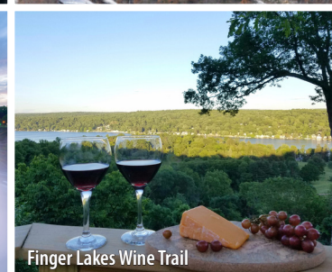
Finger Lakes Wine Trail