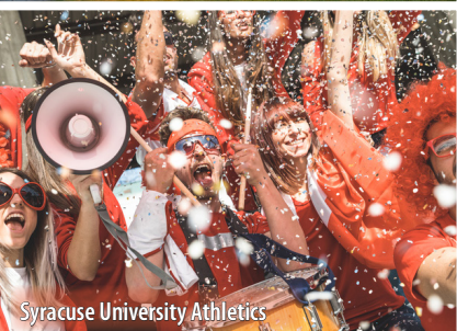
Syracuse University Athletics