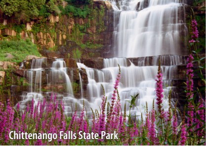
Chittenango Falls State Park