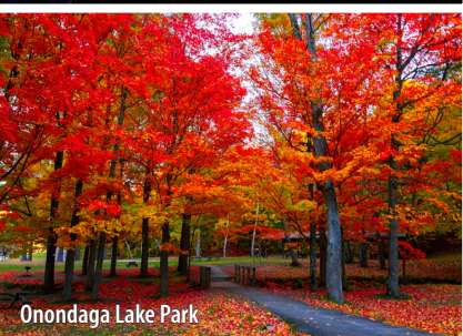
Onondaga Lake Park