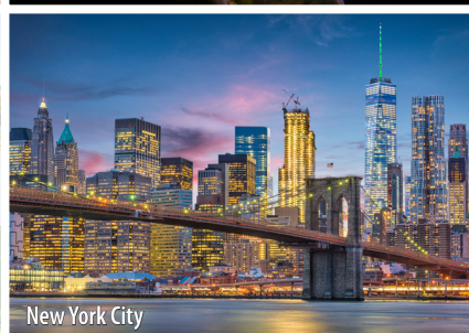
New York City