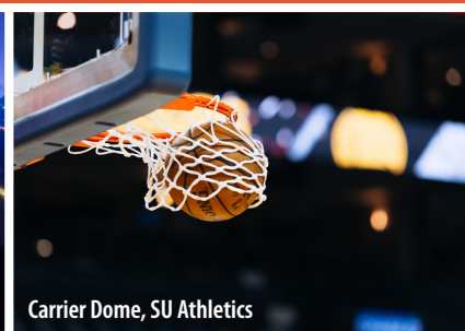
Carrier Dome, SU Athletics